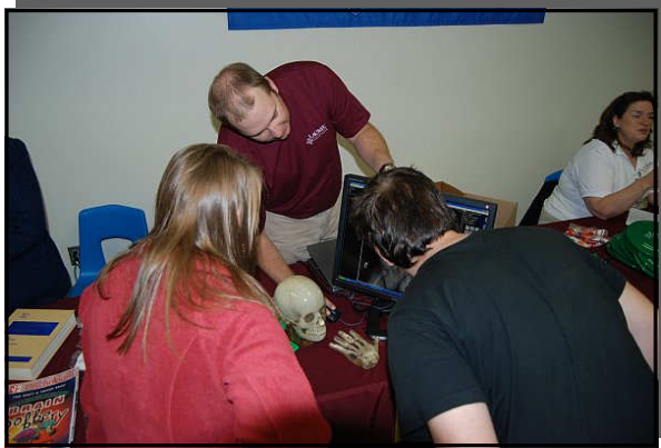
Students interested in Radiology look at a demonstration by Laurel Health System at the 2010 Health Career Fair.

The North Campus of Pennsylvania College of Technology in Wellsboro, PA was busy with activity on Wednesday, November 10, 2010. The North Campus was the site for Tioga County’s Annual Health Career Awareness Fair. The event, held in conjunction with Health Career Awareness Week in Pennsylvania, took place from 9AM to 11:30 AM.