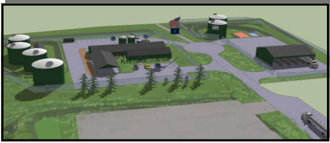
Above is the artists rendition of the Blossburg Plant that is currently under construction.

Tioga County Development Corporation continues to support the evolving Natural Gas Industry and support businesses in Tioga County. On January 14, 2011 the Tioga County Development Corporation submitted a $500,000 Reinvestment Assistance Capital Program (RACP) grant on behalf of the hydraulic stimulation fluid manufacturing facilities abatement project being constructed by Hydro Recovery LP in Antrim, PA. The Antrim Plant is slated to be the second plant built in Tioga County. Construction on the first plant began in October 2010 on about 10 acres located in Blossburg, PA and plans to open in April 2011.