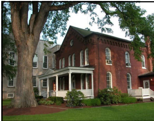
TCDC is located at 114 Main Street, Wellsboro, PA

As a result, the Tioga County Commissioners created the Tioga County Economic Development Task Force and appointed twenty (20) persons from throughout Tioga County to serve on the Task Force. The members brought to the Task Force countless years of experience and knowledge and a commitment to foster and promote the economic development of the County. Realizing the commitment needed, the Task Force began to meet every other Friday. Goals and Objectives were determined, strengths and weaknesses identified, countless meetings were held with numerous people from throughout the County . . . business persons, educators, elected officials, environmentalists and media, resulting in "A Mission Statement for Economic Development in Tioga County."