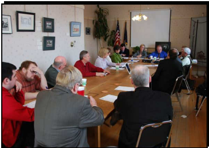
About a dozen Officials and representatives from McKean County came to Tioga County to learn more about the natural gas industry and how it could potentially impact their region.

On Friday, March 4, 2011 the Tioga County Development Corporation (TCDC) hosted a Marcellus Shale Fact Finding Meeting for McKean County. Officials and representatives from McKean County came to Tioga County with hopes to increase their knowledge of the natural gas industry and how it could potentially impact their region.