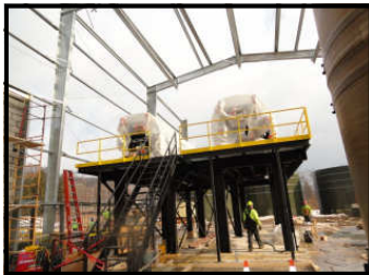
The photos to the left and right, provided by Hydro Recovery LP, show progress of the Construction of the Blossburg Plant.

Hydro Recovery LP is a manufacturer of Hydraulic Stimulation Fluid. Hydro Recovery will use a process that will convert flow back water from Natural Gas Drilling fracking operations into a usable Hydraulic Stimulation Fluid. At full capacity, both the Blossburg and Antrim plants are designed to receive approximately 300,000 gallons of high total dissolved solids fluids (HTDSF) per day producing approximately 360,000 gallons of Hydraulic Stimulation Fluid per day.