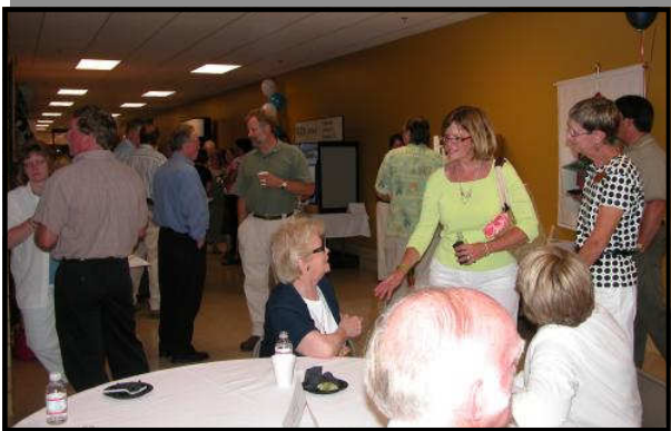
Attendees network and enjoy hors d'oeuvres during TCDC's 15th Annual Meeting held at the Wellsboro Area High School Auditorium on July 28, 2008.

Business & Non-Profit Booths to be Featured