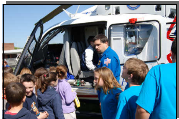
3rd and 4th Grade students listen to the Guthrie Air Crew talk about their Critical Care Helicopter

Vehicular Career Day was funded in part through a Public Education Improvement Tax Credit Grant by the Tioga County Foundation , the charitable arm of TCDC .