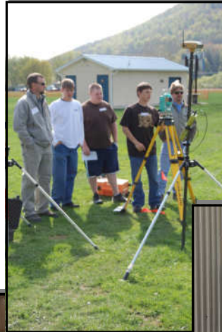
Northern Tioga School District Students learn about a variety of different vocations and careers during their Career Fair.

The goal of the Northern Tioga School District Career Fair was to “plant the seeds” for career development. NTSD Guidance Counselors organized the event.