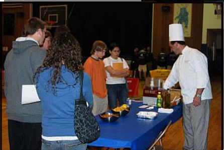
10th Grade Students at the Southern Tioga School District Career Fair explore different professions through hands-on activities and demonstrations.

The event is held for sophomores in the district's three high schools and, this year, was funded by a grant from the Tioga County Foundation , the charitable arm of the Tioga County Development Corporation . STSD students study careers through the PA Educational Improvement Tax Credit Program. Almost two dozen local presenters, from careers such as food service, the trucking industry, and photography, brought examples of their work and/or tools of their trades to share with the students. Over 150 tenth grade students had the opportunity to spend 15 minutes with five career presenters that they choose ahead of time. Presenters readily shared their career experiences and advice for young people anticipating entry into those career fields. STSD students study careers in a required course titled "Career Pathways Portfolio" and the Career Fair is an opportunity for them to make a personal connection to their studies. STSD Guidance Counselors from Liberty, Mansfield, and North Penn High Schools organized the Career Fair.