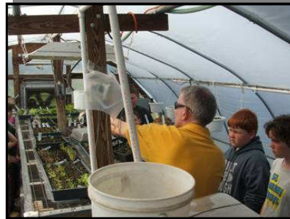
5th Grade Students explore greenhouses, farm safety and the process of making Maple Syrup.

Some of the other day's events included a trip to Brion Crest Elk Farm and Heyd's Chicken Farm.