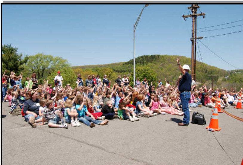
3rd & 4th Grade students from Tioga County's three public school districts attend vehicular career day at Mansfield University, helping them gain an early awareness of career choices in Tioga County.

These grants have been made possible through contributions from Citizens & Northern Bank , Northwest Savings Bank & Ward Manufacturing, LLC .