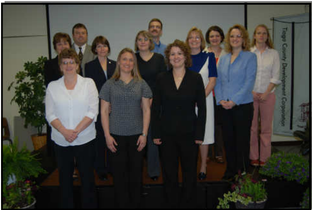
Community Leadership Program Class of 2008

The Tioga County and Graduation Ceremony.