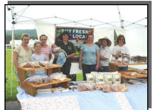
Liberty Farmers' Market, Inc.