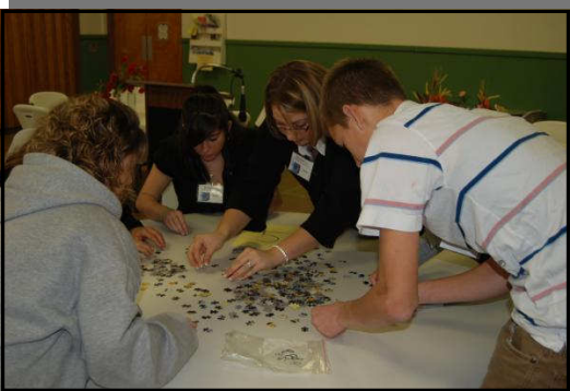
Pictured here are participants of the YLP Class of 2010 participating in the "Leadership Styles" Team Puzzle Building exercise.

On November 3, 2009 the Tioga County Development Corporation Leadership Tioga County Youth Leadership Program Class of 2009 studied Health & Human Services during Session 2 at St. Paul's Episcopal Church in Wellsboro. Students participated in various activities aimed at introducing them to the many Human Service and Healthcare Services available through the Tioga County Department of Human Services & Laurel Health System to area residents.