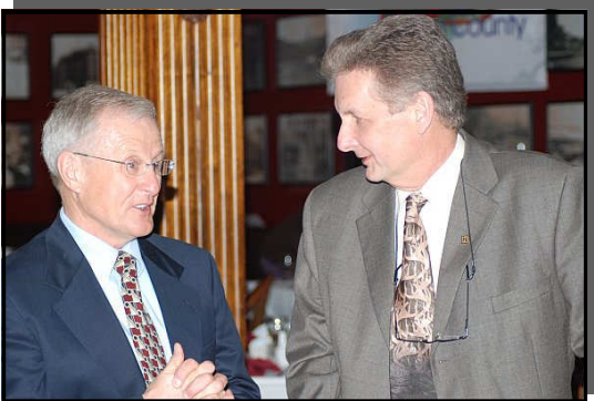
The TCDC Legislative Breakfast has been a very successful event for TCDC and Tioga County thanks to our members!

On Thursday, April 9, 2009 the Tioga County Development Corporation (TCDC) Board of Directors hosted our 13th Annual TCDC Legislative Breakfast at the Historic Penn Wells Hotel, Wellsboro, Pennsylvania. Nearly 200 TCDC Members and Supporters attended the informative breakfast. TCDC hosts the annual event because legislative activities occurring in Washington and Harrisburg immensely impact our businesses and communities throughout Tioga County.