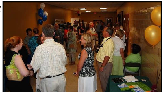
TCDC Members brows vendor booths and enjoy casual conversation at TCDC's 15th Annual Meeting in July 2008.

The event will be catered by Culinary Arts students from the Northern Tioga School District. The attire for the event is corporate casual.